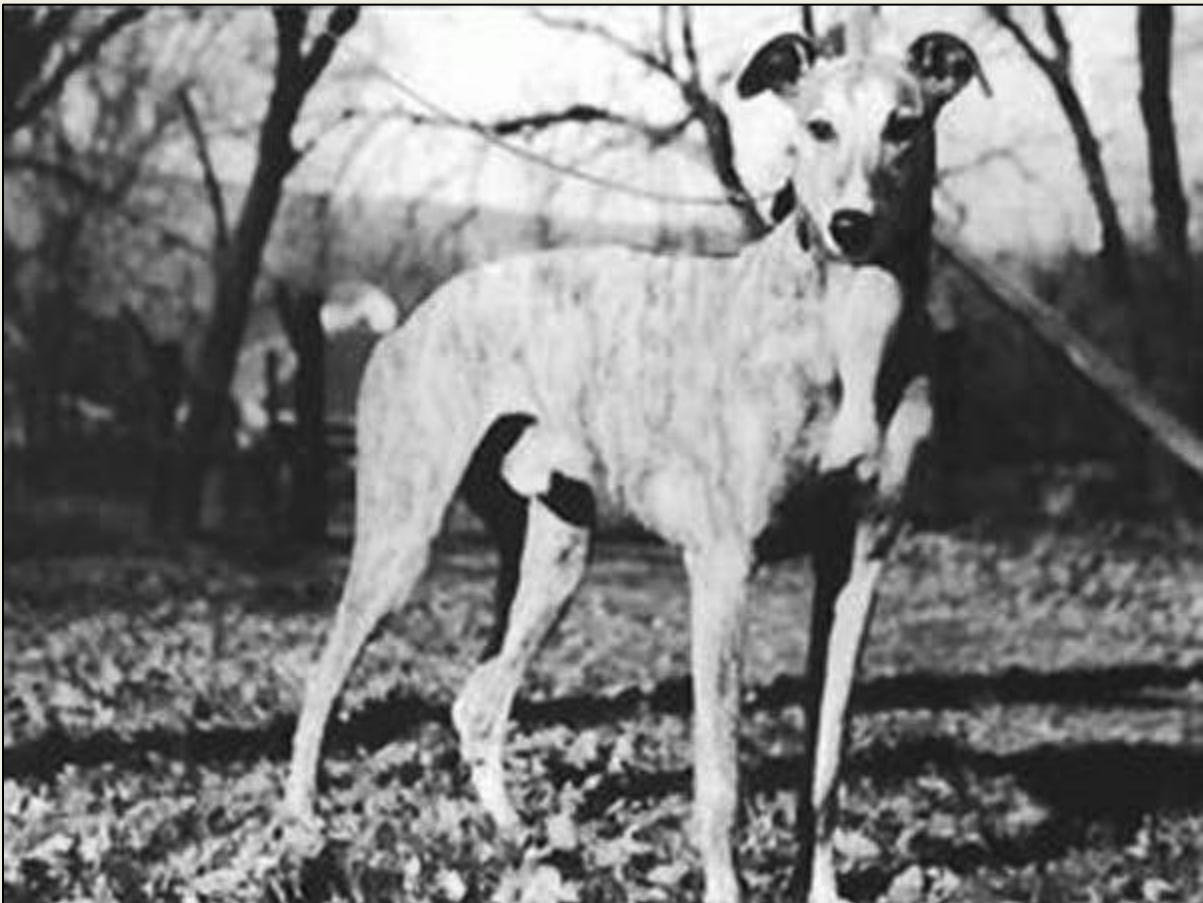
Tell You Why, grandson of Tumble Bug, and fellow AGRA & U.S.A.Hall of Famer

Just prior to Tumble Bug's exportation to America, he was mated in Australia to a female named Marnaleen. The litter wasn't whelped until Tumble Bug had arrived in America. One pup in that litter would later stake claim to a breeding strain all his own, one that would overshadow the feats of his dad. In later years, his offspring would arrive on our shores to totally restructure the bloodline patterns in this nation. The pup's name, of course, was Rocket Jet.