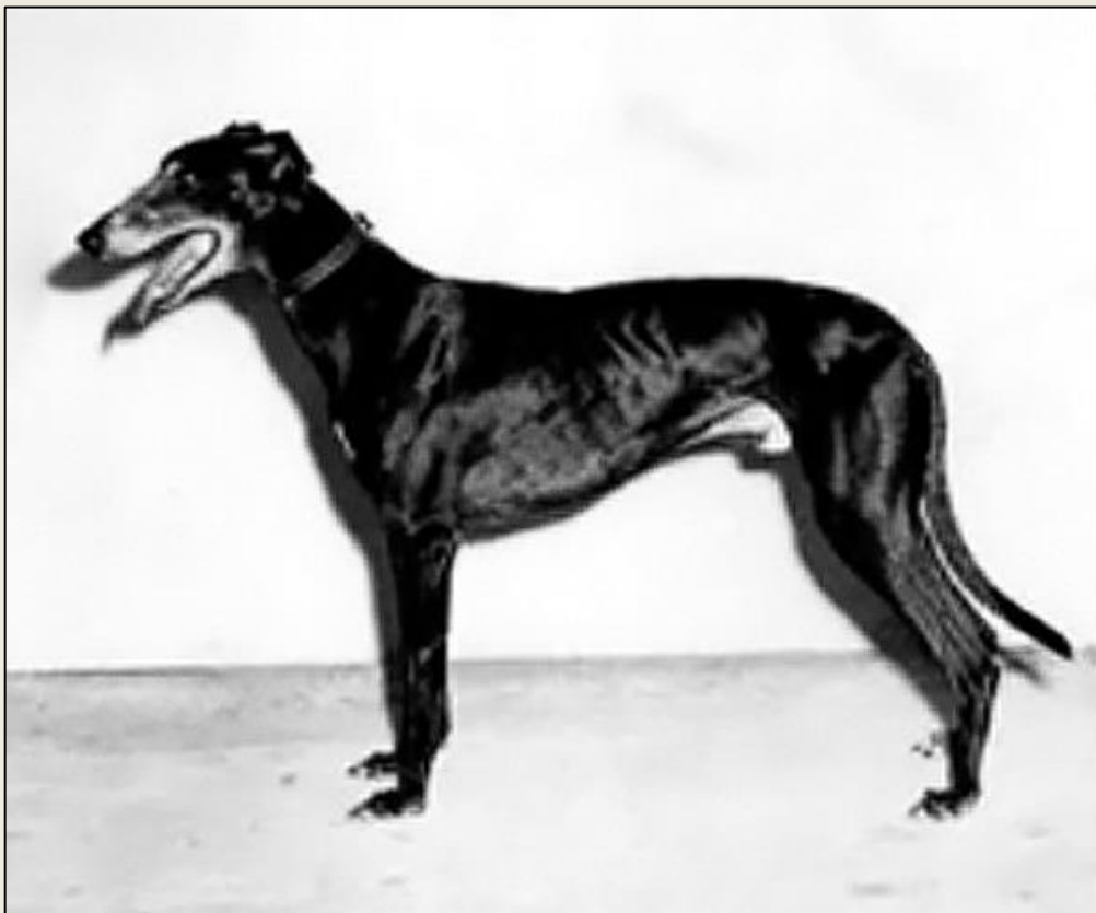
Saddler, the greatest American son of Tumble Bug.

Tumble Bug it seems, is doomed to a sort of injustice, although it's not altogether an unenviable one. For time eternal, his name will almost always be uttered in the same breath with that of his at-least equally famous son Rocket Jet and more famous grandson Tell You Why. It is the price an outstanding animal has to pay when he produces such class.