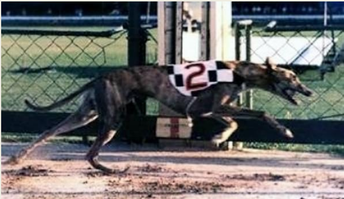
Famous 70's racer and super sire Temlee, traces back to Tumble Bug